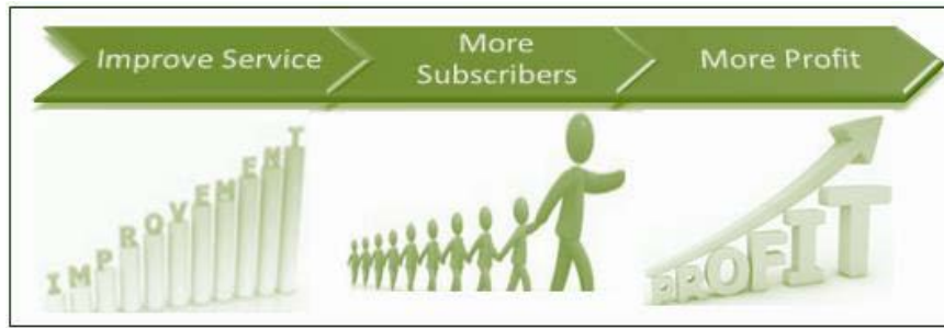
Figure 3. Operators' vision of using heterogeneous wireless communication technologies communication technologies